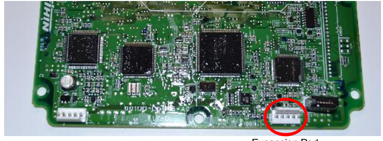
Ver. 1.0 November 2019

Connect the AIM Interface to the ECUs or Expansion Box's Expansion Port.