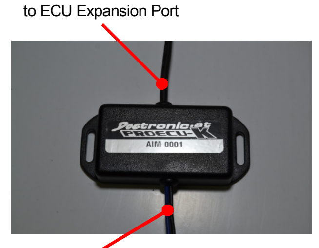
to AIM Dashboard (RS232)

The AIM Interface gives the possibility to connect an AIM MXL Dashboard to the ProECU-K.